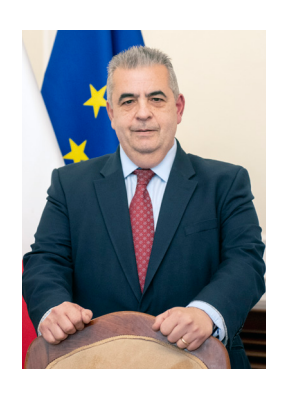
Minister for Social Policy and Children's Rights

Children represent the future of our society, and as a Government we bear the responsibility to make it possible for all children to succeed.